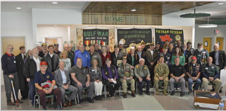
2025 Veterans History Project Veterans