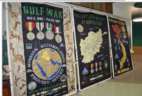
Information panels highlighting the Gulf War, Afghanistan, and Vietnam courtesy of Post 10380 member the late Bill Ostermeyer