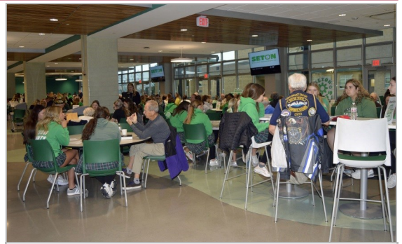
Veterans shared their life experiences with students in Seton's Halo Cafe